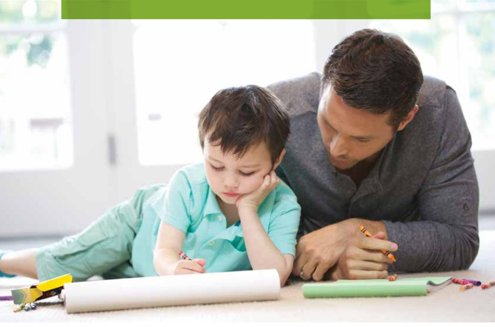
Proven, reliable comfort, up to 16 SEER rating