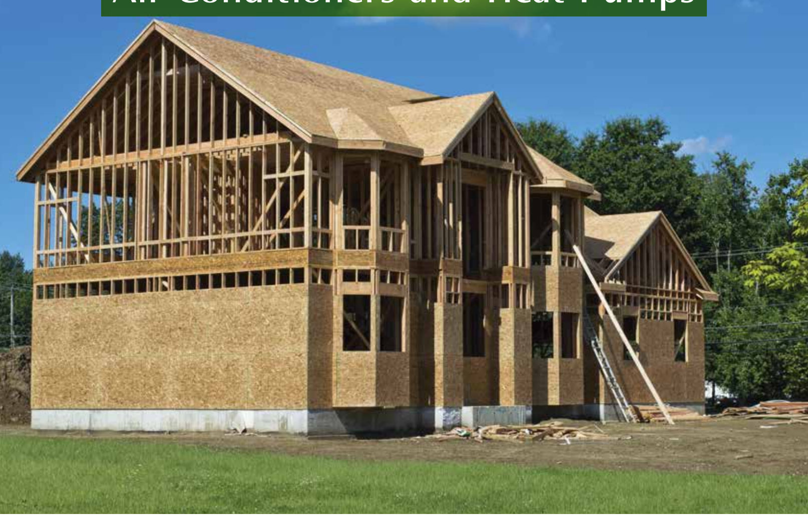
Reliable, efficient comfort up to 16 SEER